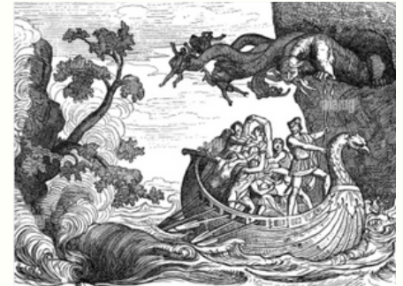
Ulysses and his men fight against Scylla, illustration of the Odyssey, 1880 (Public domain image)