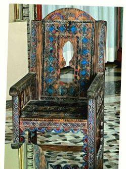
Detail of Tavolo Love Difference - Michelangelo Pistoletto