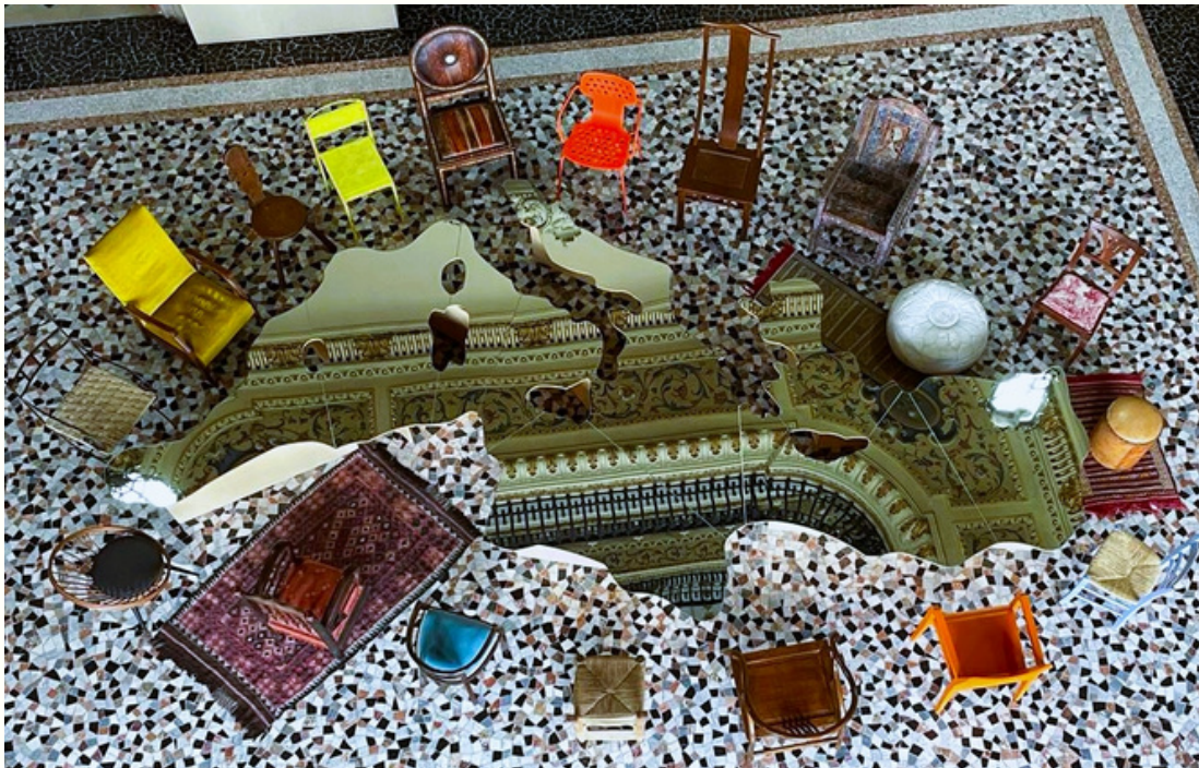
Tavolo Love Difference - Michelangelo Pistoletto

Hotel Perla del Golfo Terrasini, PALERMO